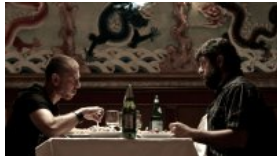
Claudio Gioe and Pierfrancesco Favino In 'Without Pity'

http://www.hollywoodreporter.com/review/pit-v-senza-nessuna-pieta-venice-729117#comments