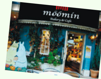
Moomins Café Tokyo, Japan