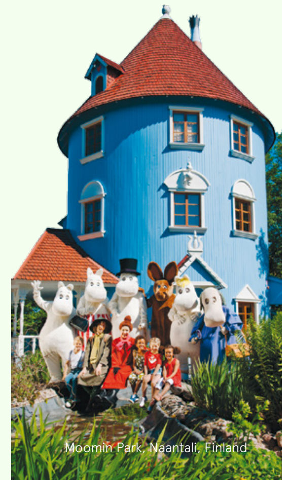
Moomin Park, Naantali, Finland