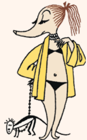
AUDREY GLAMOUR Movie star, Snorkmaiden's idol.