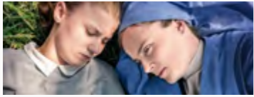
MARIE'S STORY a film by Jean-Pierre Améris