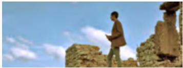
THE BRIDGES OF SARAJEVO a film by Godard, Meier, Schanelec, Begic, Puiu, Di Costanzo, Kaleyv,...

Venice Film Festival Orizzonti 2014 Tiff Discovery 2014